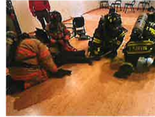
Search rope training DTFR and CMFD Parkway Dr.