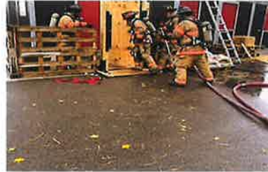
Live Fire Training Joint Tower