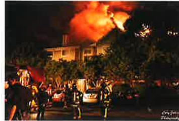
LSFD structure fire Carrington Ln